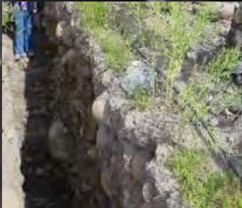
Andes Mountain Stones

Multi_Mixes + Multi_Flavors + Multi_Textures